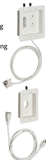
TVBR21K with two-gang upper box and single-gang lower box