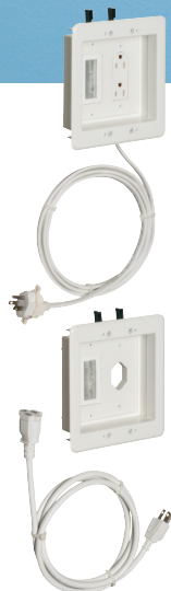
TVBR22K with TWO two-gang upper and lower mounting boxes