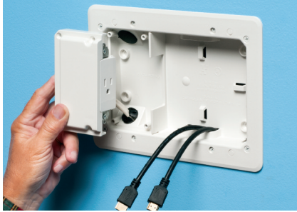
6 Attach receptacle mounting bracket to box.

4 Install trim plate. Pull cable through connector. To install box in hole tighten wing screws (see 3).