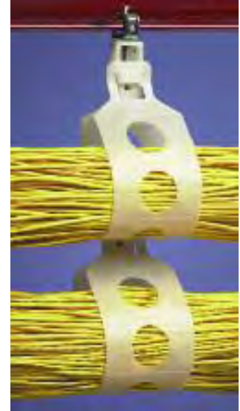
MULTIPLE LOOP HANGERS Stacked, parallel mounting on 1/4" rod