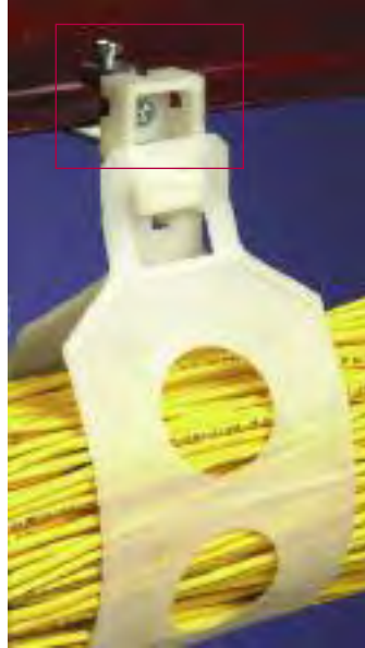
SINGLE LOOP Parallel mounting on 1/4" beam clamp