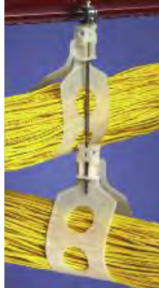
MULTIPLE LOOP HANGERS Stacked, perpendicular mounting on 1/4" rod