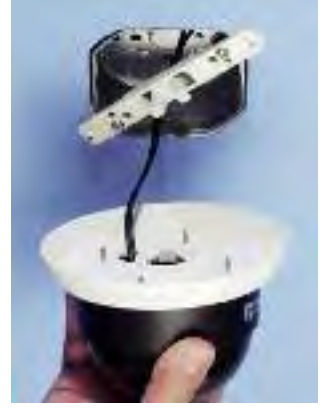
Place assembly on bracket. Turn clockwise to lock. Install set screw.

Done! Secure camera installation on ceiling or wall.