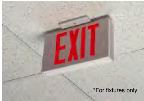
*For fixtures only

Meets NEW UL Requirements...Holds fixtures* up to 50 lbs