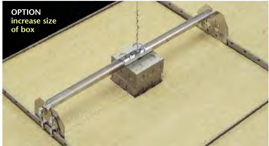
OPTION increase size of box

OPTION You can make the FS427SCL an even bigger box by adding a standard 1-1/2" deep extension ring (not supplied). Attach the (supplied) extension brackets to the ends of the support bar, then to the ceiling grid. They support the box/extension ring assembly and keep it flush with the ceiling.