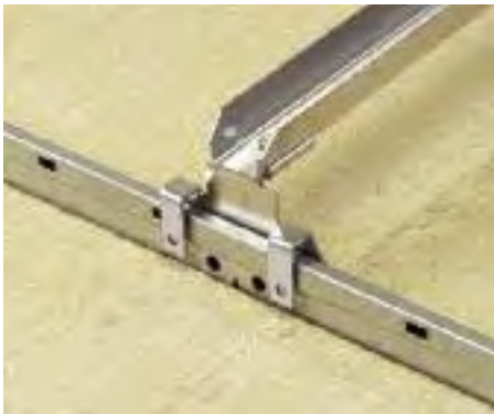
2 FS427SCL is shipped ready for a centered installation on the ceiling grid. Position ends of support bar over the ceiling grid (tees).