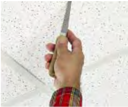
1 Cut 4-1/16" x 4-1/16" hole in ceiling tile.

One-piece • Heavy-duty 4x4 Steel Fixture Box