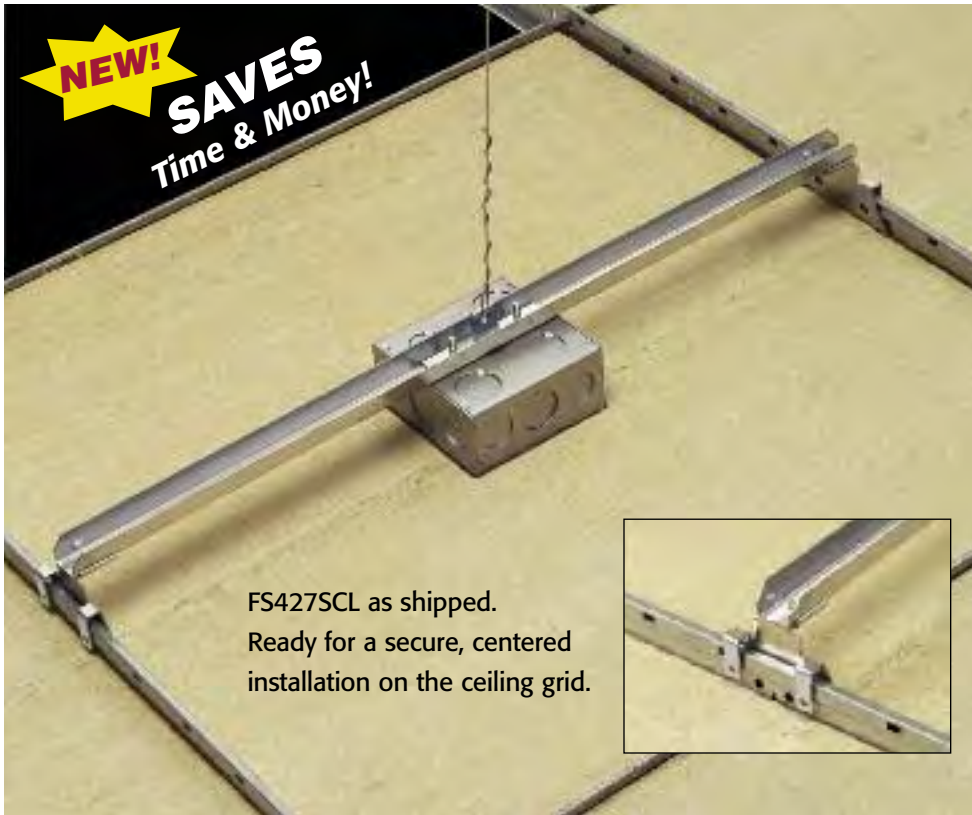
FS427SCL as shipped. Ready for a secure, centered installation on the ceiling grid.

One-piece • Heavy-duty 4x4 Steel Fixture Box