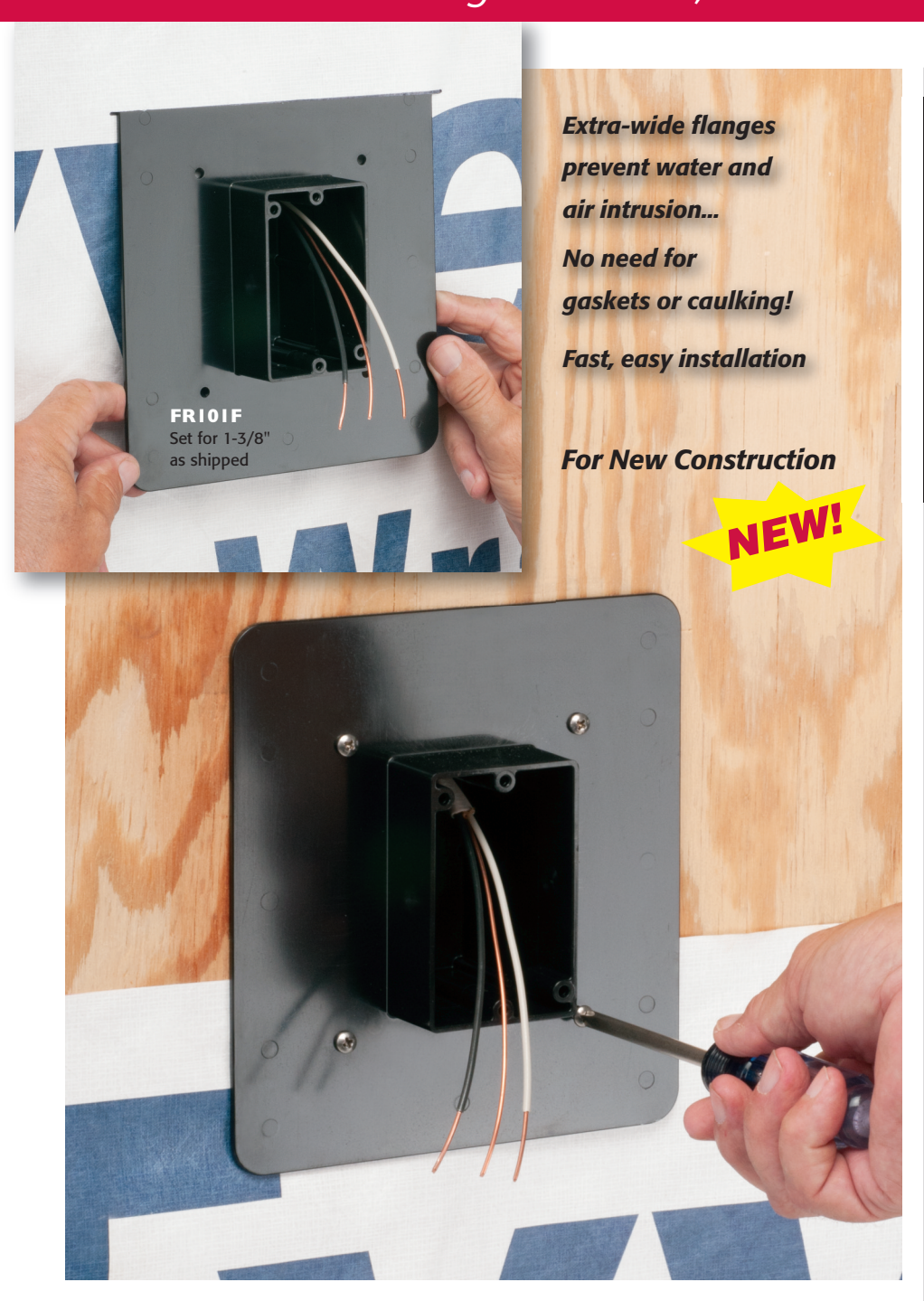
FR Series Boxes ship pre-assembled; ready for 1-3/8" wall finish thickness