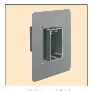
3 Assembled for 5/8" finish