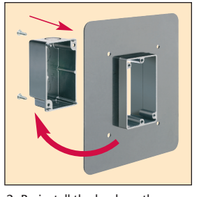
2 Re-install the back on the OPPOSITE side of the box.