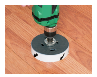
Using a hole saw cut a 5" diameter opening in the floor and subfloor.