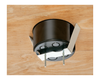
Underside of subfloor