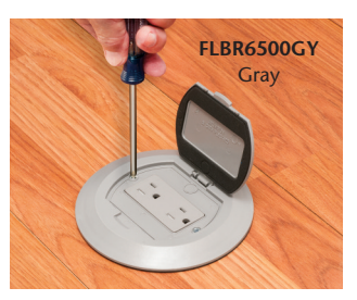
4 Fasten cover on box using the two #6-32 x 1" screws provided.