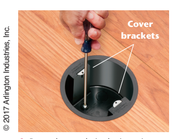
3 Rotate box to desired orientation. Tighten #10-32 screws to pull box securely against the underside of subfloor.

Kit includes non-metallic floor box. plastic cover with single flip lid, cover cap, 15A decorator-style receptacle, (2) #6-32 x 1" screws, NM94 and NM95 cable connectors