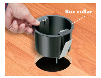
2 Pull wire through supplied NM cable connector. Insert box, bending the clip as necessary to fit through the opening.