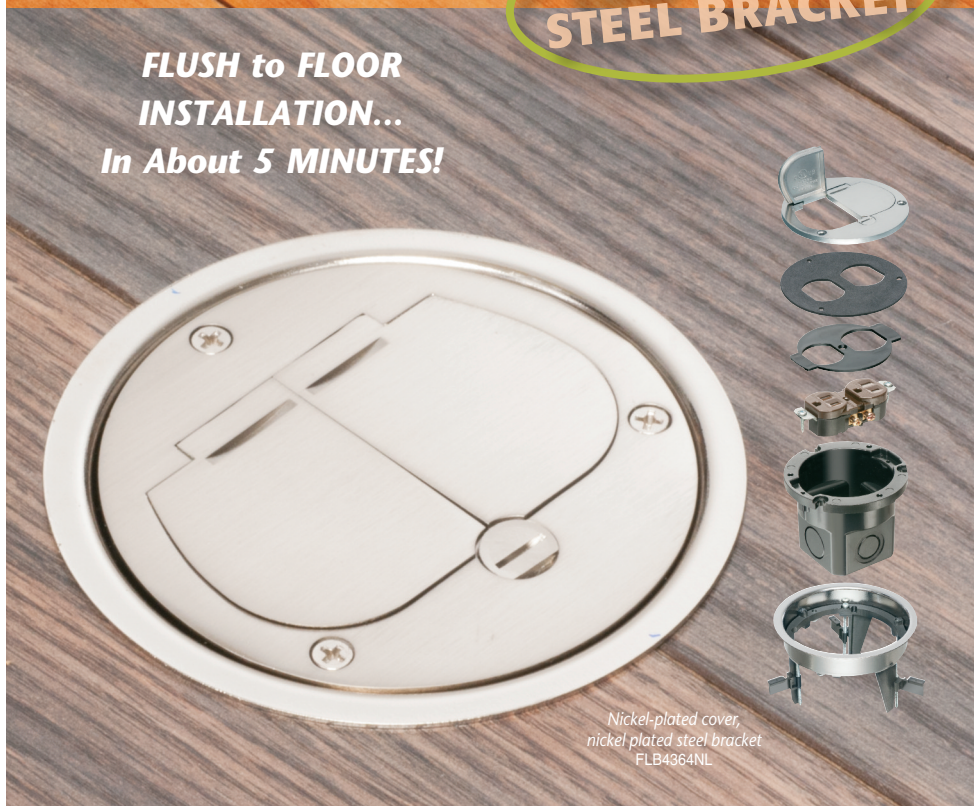
Nickel-plated cover, nickel plated steel bracket FLB4364NL

FLUSH to FLOOR INSTALLATION... In About 5 MINUTES!