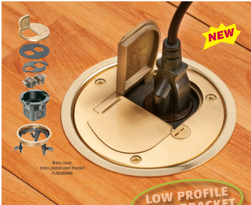
Brass cover, brass plated steel bracket FLB4364MB

Fastest, FLUSH installation • Low Profile Metal Covers, Steel Bracket