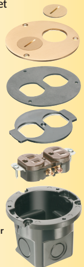
Floor Box Kit with brass cover FLB3520MB

Complete the job with a round 4" metal cover in brass or nickel-plated brass.