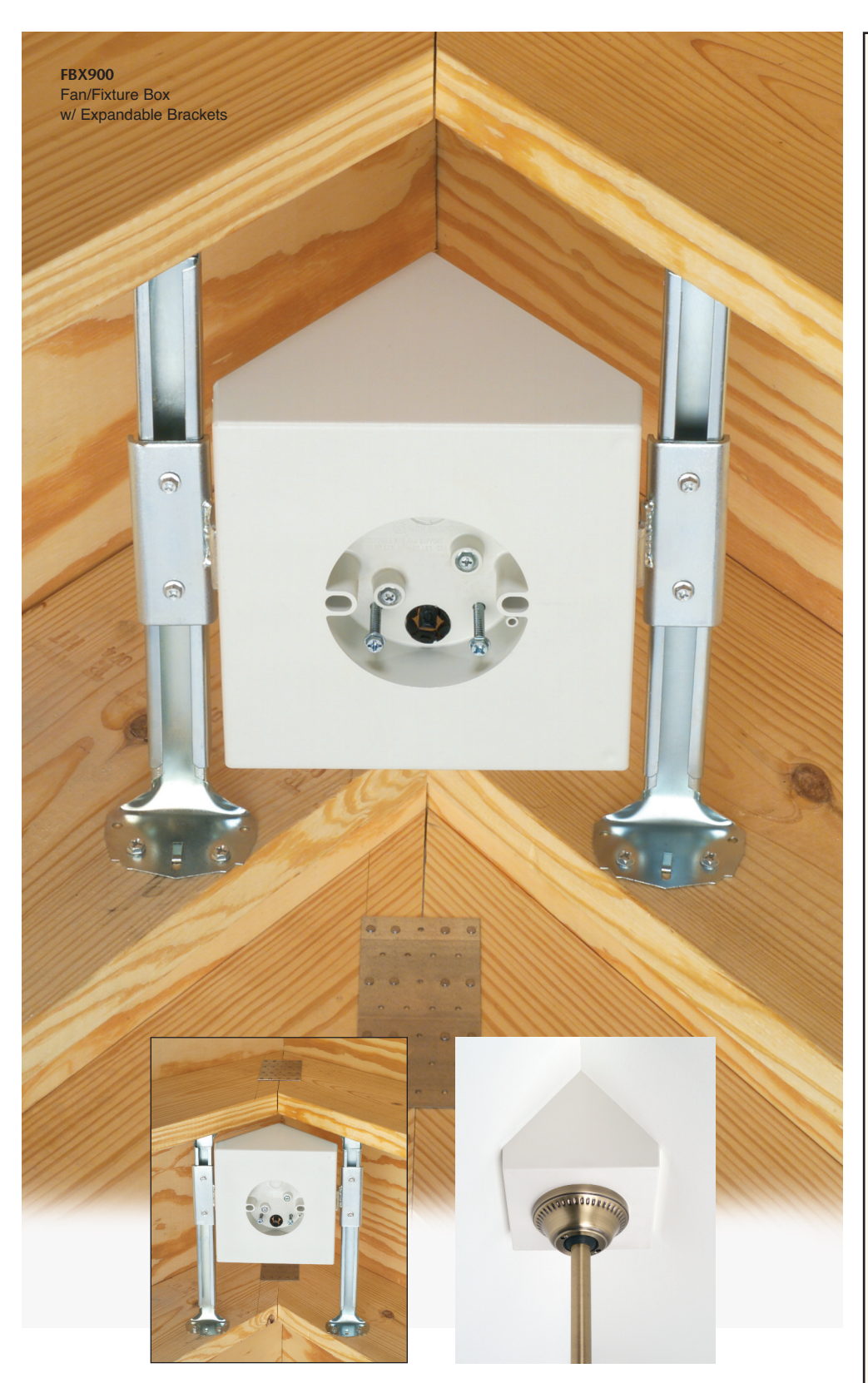
Easy! - Slide the box along the brackets to center the fan or fixture in the room

Arlington's FBX900 Fan and Fixture Box provides a perfectly centered installation between two rafters – even if the desired mounting point is not centered on the rafters.