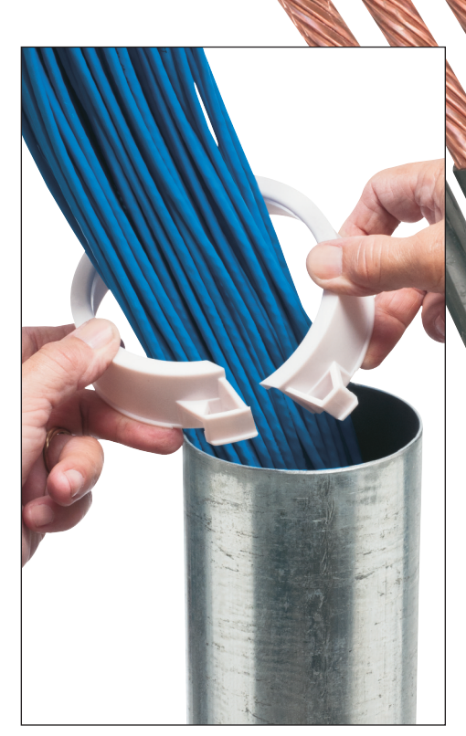
Easy installation on EMT!