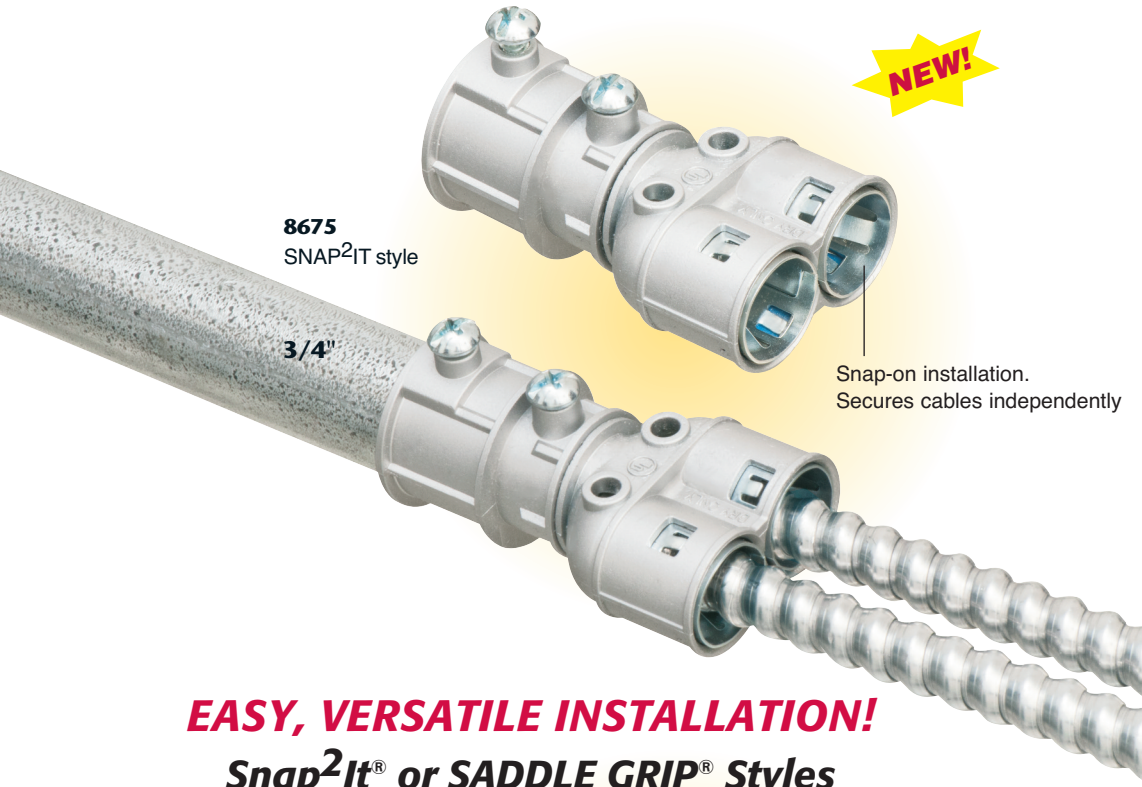
8675 SNAP 2 IT style

EMT to Duplex Flexible Metal Cable • Easy to Install