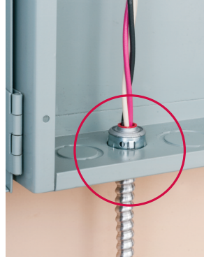
387A, 407A Installation of assembly with LOCKNUT