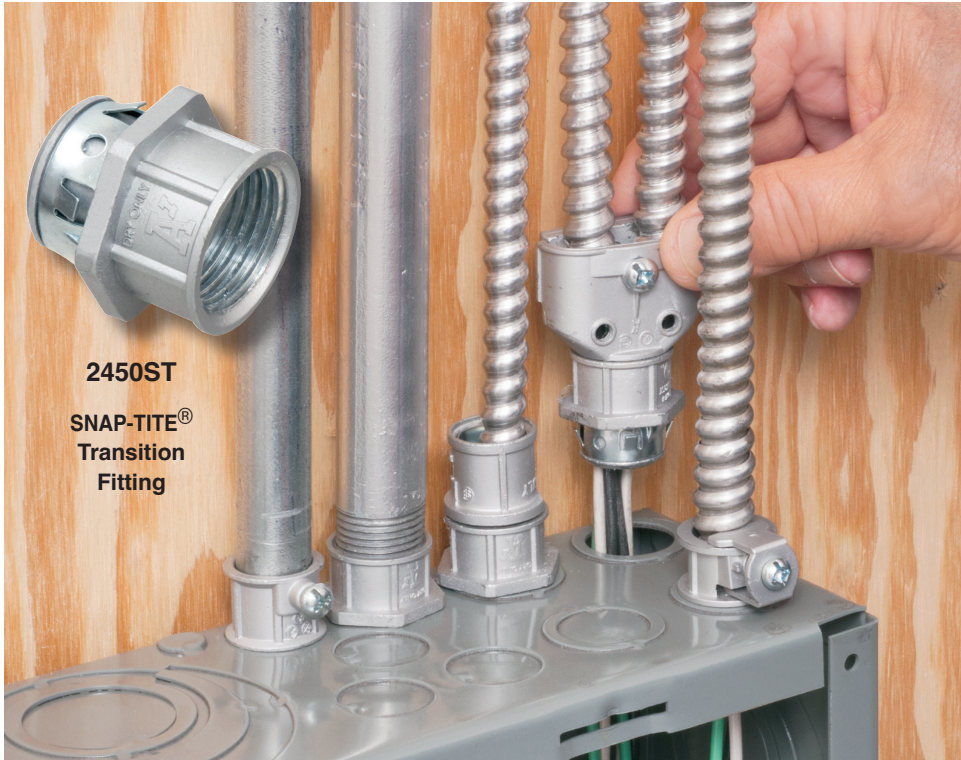
2450ST SNAP-TITE® Transition Fitting

Allows Cable, Conduit Installation in Tight Spaces