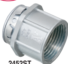
2452ST Fits 1" knockout, 1" threaded pipe/hub

Easy Installation of ADDITIONAL Conduit or Cable in a Tightly Spaced Panel, Box or Enclosure