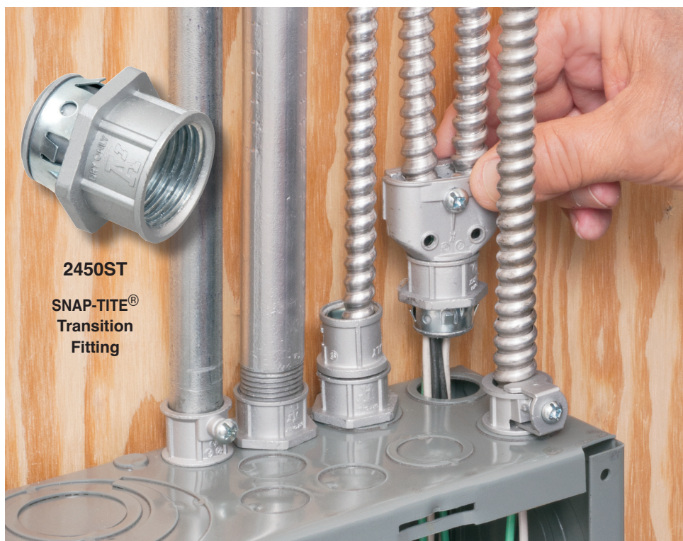
2450ST SNAP-TITE® Transition Fitting

Allow Cable, Conduit Installation in Tight Spaces