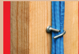
1/2" Drive Ring with four cables