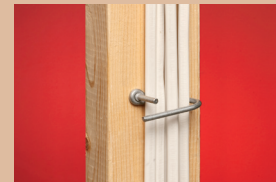
7/8" Drive Ring with non-metallic sheathed cable