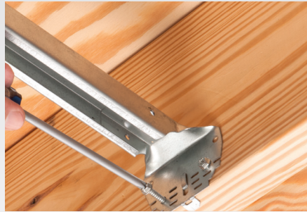
Bracket mounts securely to joists.