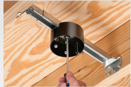
Loosen center screw to position box on bracket.