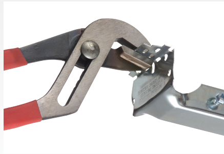
Bracket ends are pre-set for a 1/2" ceiling. For other ceiling depths, bend the bracket ends along the appropriate score line.