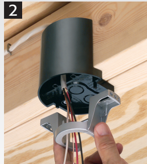
2 Position mounting bracket over locator posts to assure proper position. Pull wires through KO.