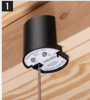
1 Position box alongside joist. Tighten center screw, mounting box to joist.