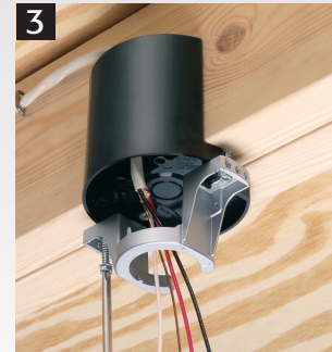
3 Remove captive bracket installation screws. Use them to mount fan/fixture bracket. (Installation of drywall not shown.)