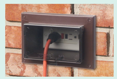
In Box® Saves Time. Looks Great!