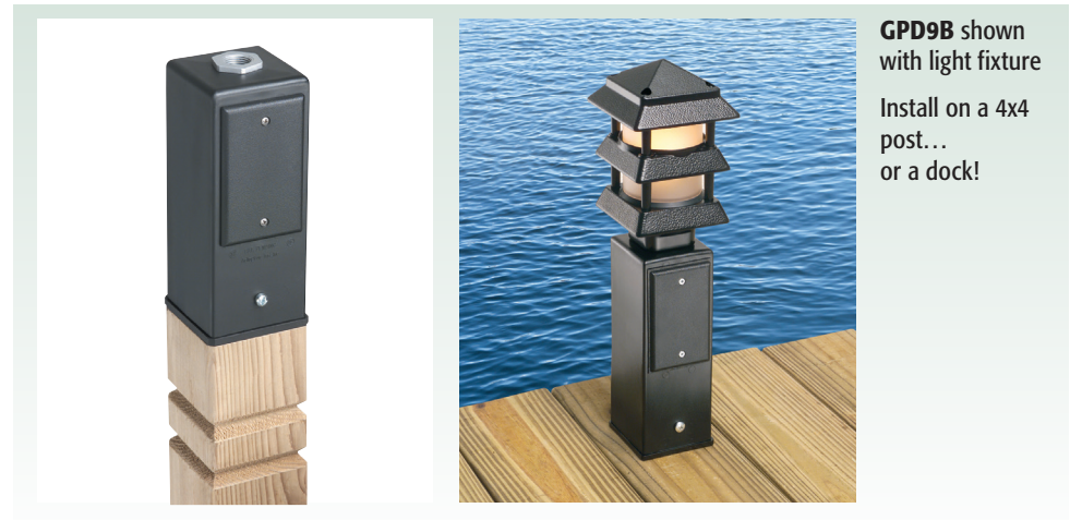
GPD9B shown with light fixture Install on a 4x4 post... or a dock!