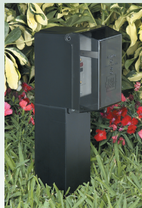
When you can have a great looking and long-lasting job like this!