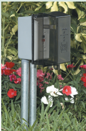
Why install boxes this way...