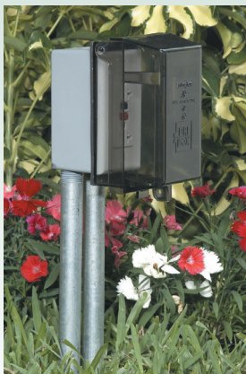
Why install boxes this way...