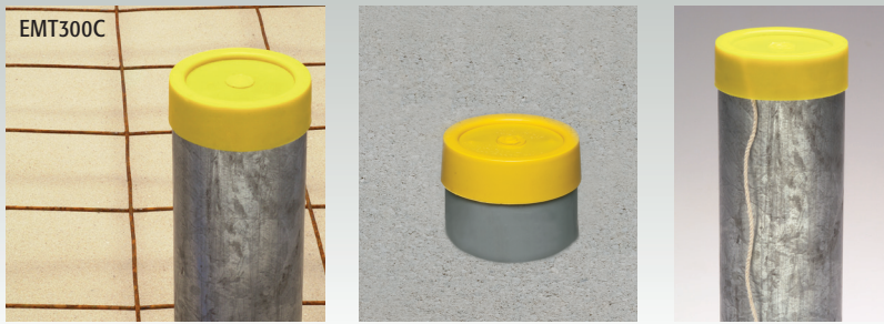
(String can be used to aid removal.)

Use this capped version to seal off conduit during concrete pours. Then remove cap/seal with razor knife or use screwdriver to punch hole in cap.