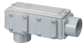
935NM ships as LB Converts to a...