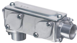
930 ships as LB