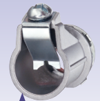
BACK VIEW Note angled, two-prong clip