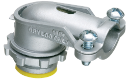
850A - 856A