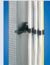
CS20SC on Metal Stud

Position the CS20SC in the desired location on a wood or metal stud and tighten self tapping screw, then insert cable or cables.