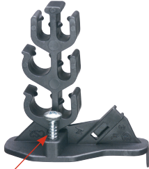
#8 self-tapping sheet metal screw CS20SC