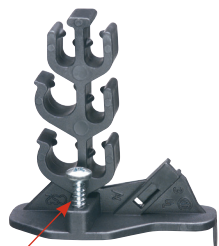
#8 self-tapping sheet metal screw CS20SC

Supports up to four 14/2 - 10/2 flat (any combination) and two 14/3 - 10/3 (any combination) NM cables.